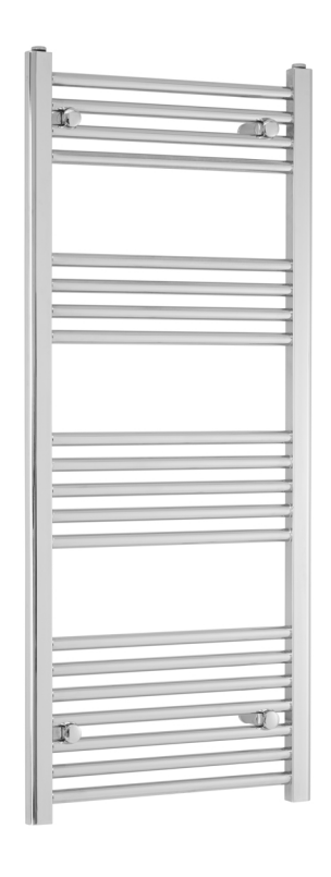
5 Year Guarantee

Please note: Radiator shown for illustration purposes only.